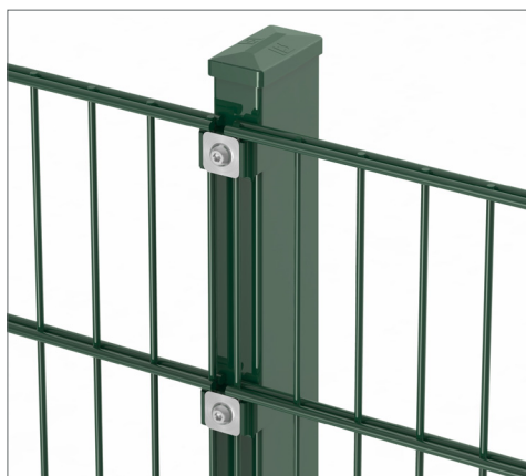
with stainless steel fixing plate