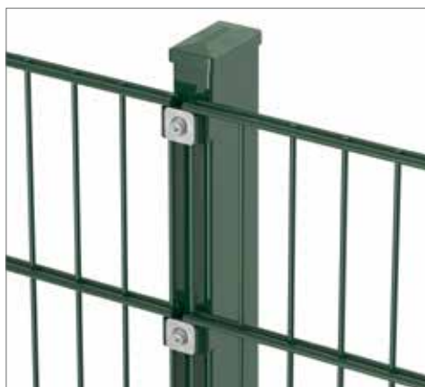
with stainless steel fixing plate