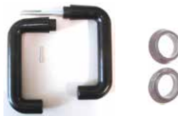
lock handles & washers (by pairs)