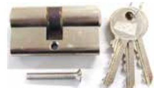
lock and cylinder + stainless steel M6 x 20 mm