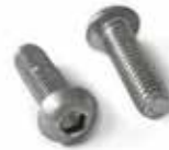
M8 x 25 mm