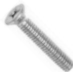
stainless steel M6 x 25 mm