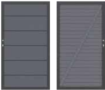
single swing gates