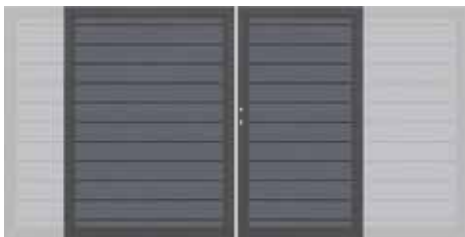
double swing gates