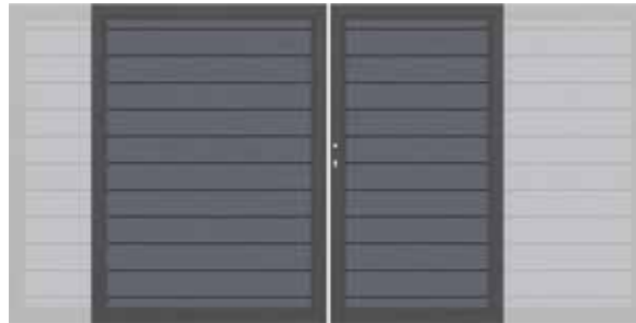
double swing gates