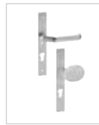
Handle & doorknob