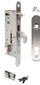
Lock & cylinder