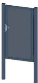
single swing gate