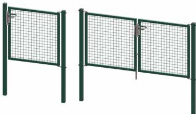
Egidia M50 swing gates