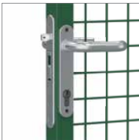
Stainless steel built in lock with lock plate and Aluminum handles