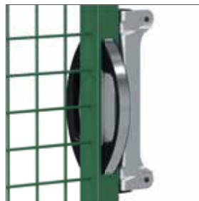
Aluminum Handle pair for double swing gates