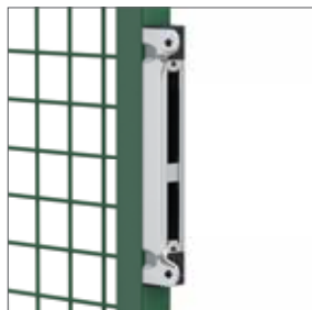
Universal gate catcher made out of Aluminum