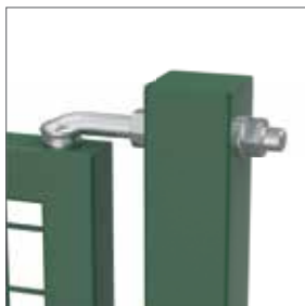
Solid and easy to adjust Hot Dip Galvanised M16 hinges