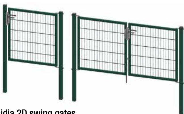
Egidia 2D swing gates