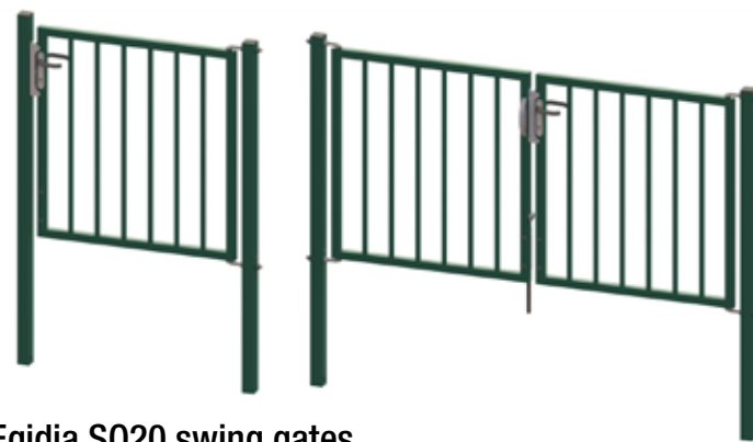
Egidia SQ20 swing gates

Europe Blokkestraat 34b B-8550 Zwevegem Tel: B: +32 56 73 46 46