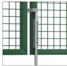
Ground bolt and holder for double swing gates