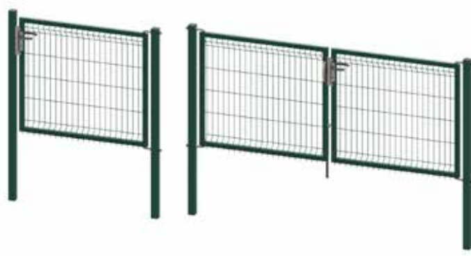
Egidia 3D swing gates