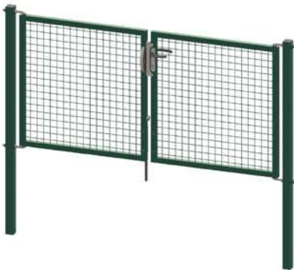
Egidia 3D swing gates