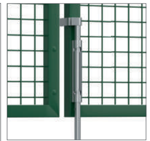
Ground bolt and holder for double swing gates