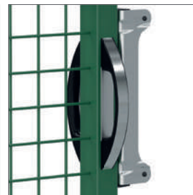
Aluminum Handle pair for double swing gates