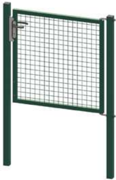
Egidia M50 swing gates