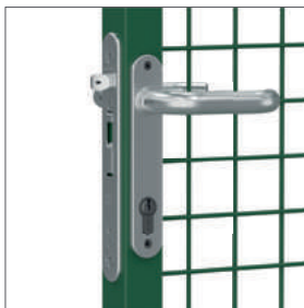
Stainless steel built in lock with lock plate and Aluminum handles