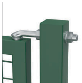
Solid and easy to adjust Hot Dip Galvanised M16 hinges