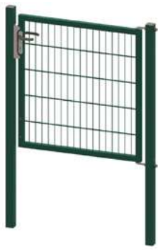
Egidia 2D swing gates